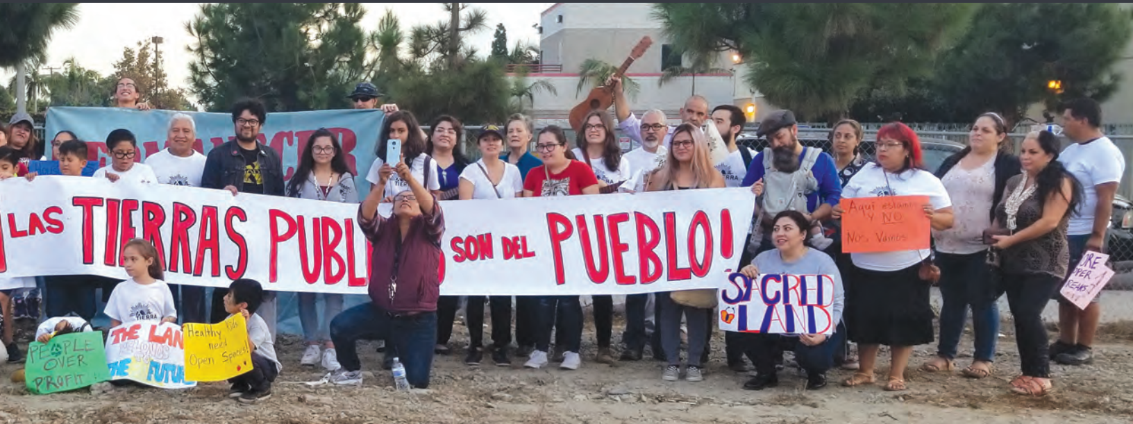
Marcha Por la Tierra, October 2019 in Santa Ana, California