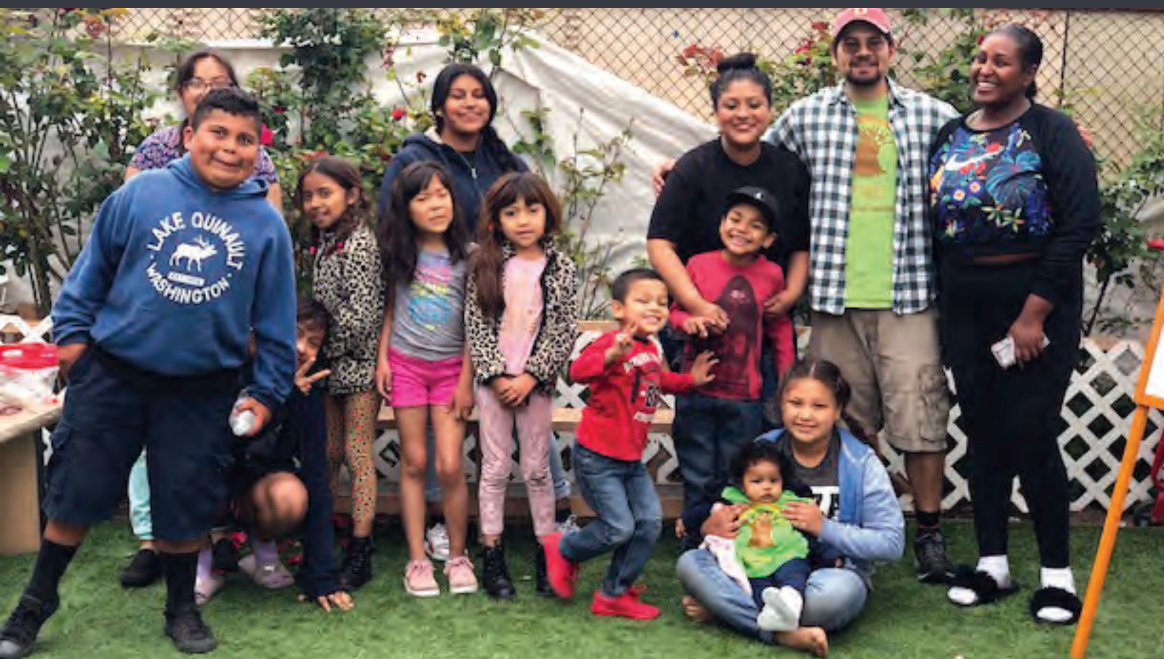
T.R.U.S.T. SOUTH LA's Earth Day celebration at 42nd Place Community Mosaic, 2019