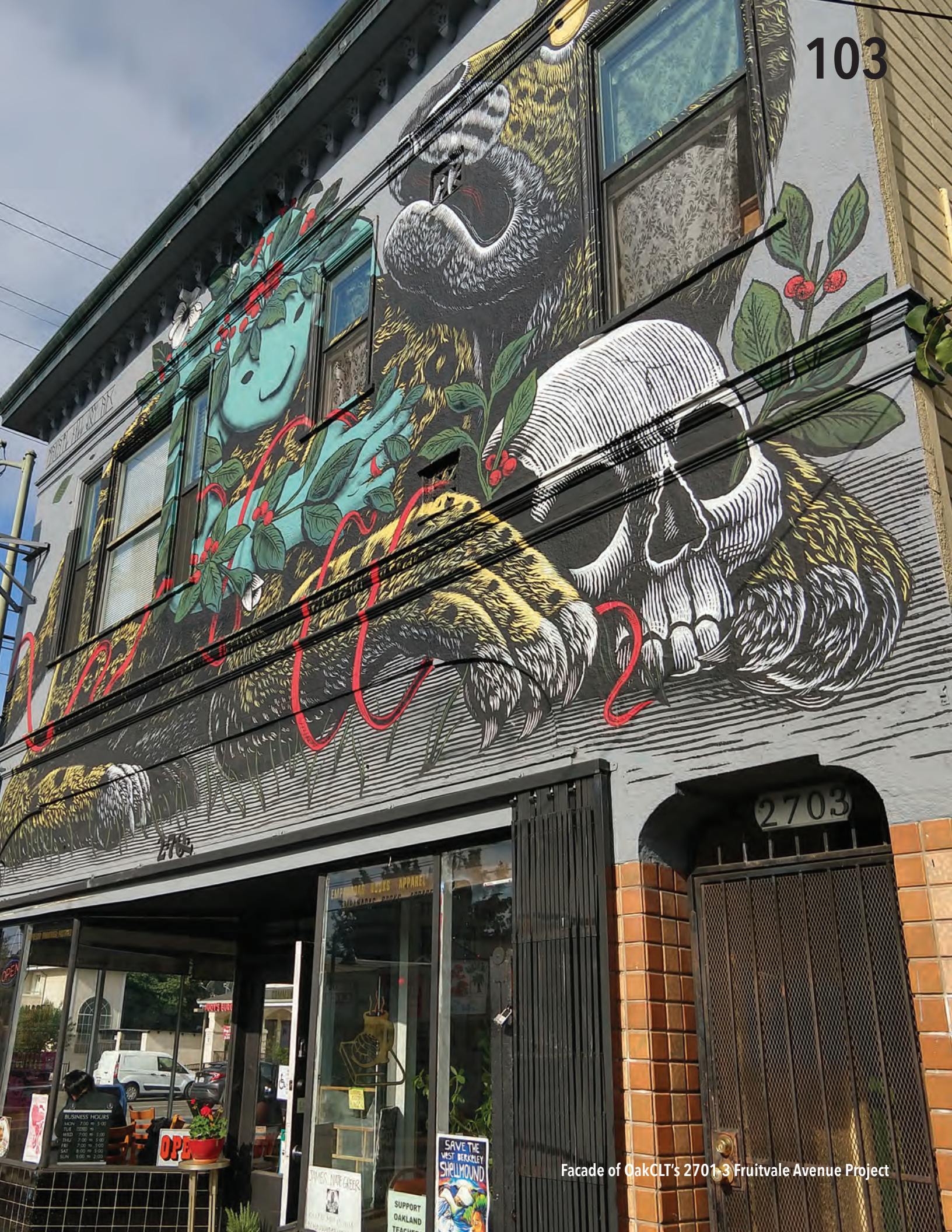
Facade of OakCLT's 2701-3 Fruitvale Avenue Project