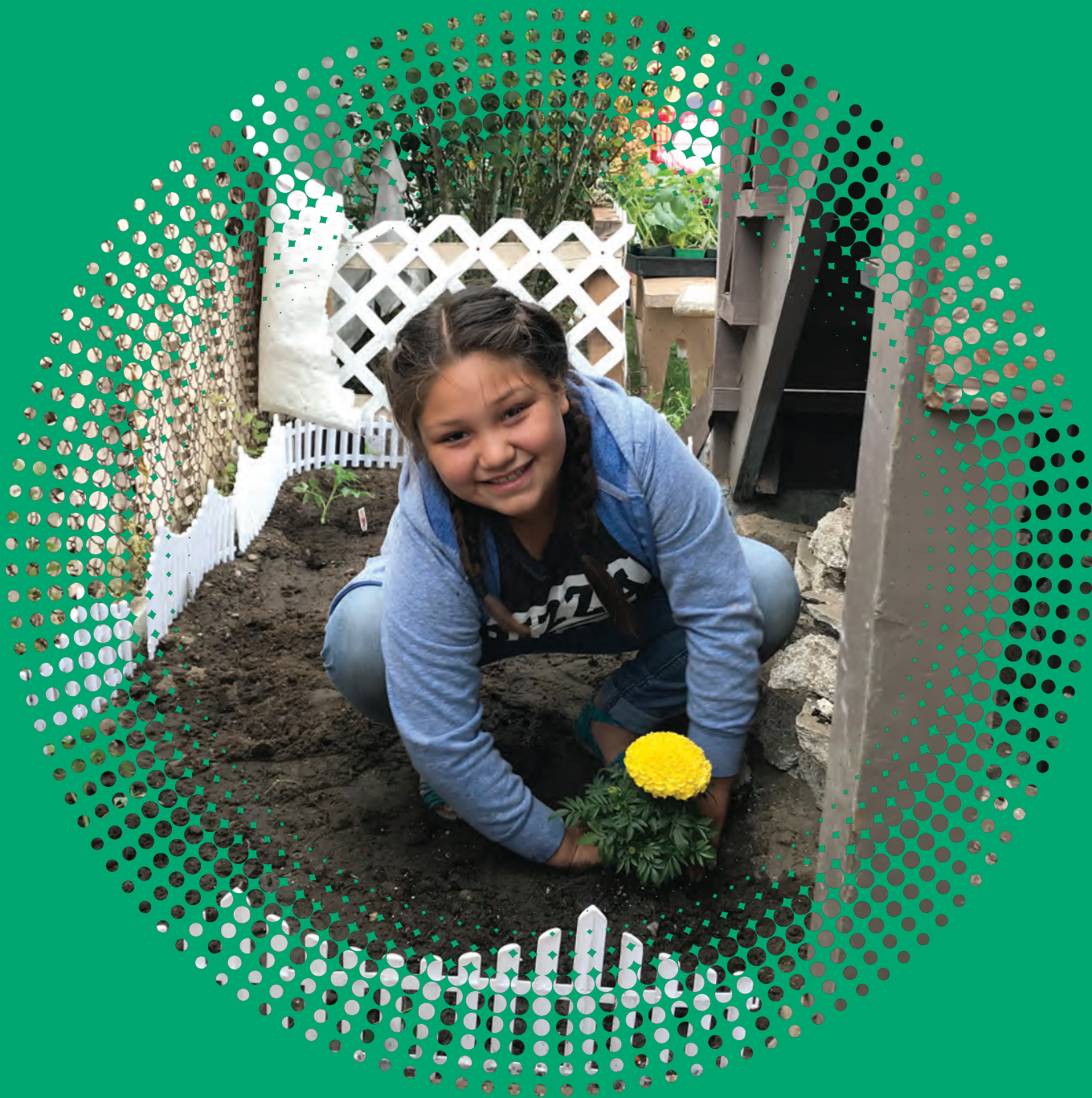
Young T.R.U.S.T. South LA resident planting a garden at 2019 Earth Day celebration