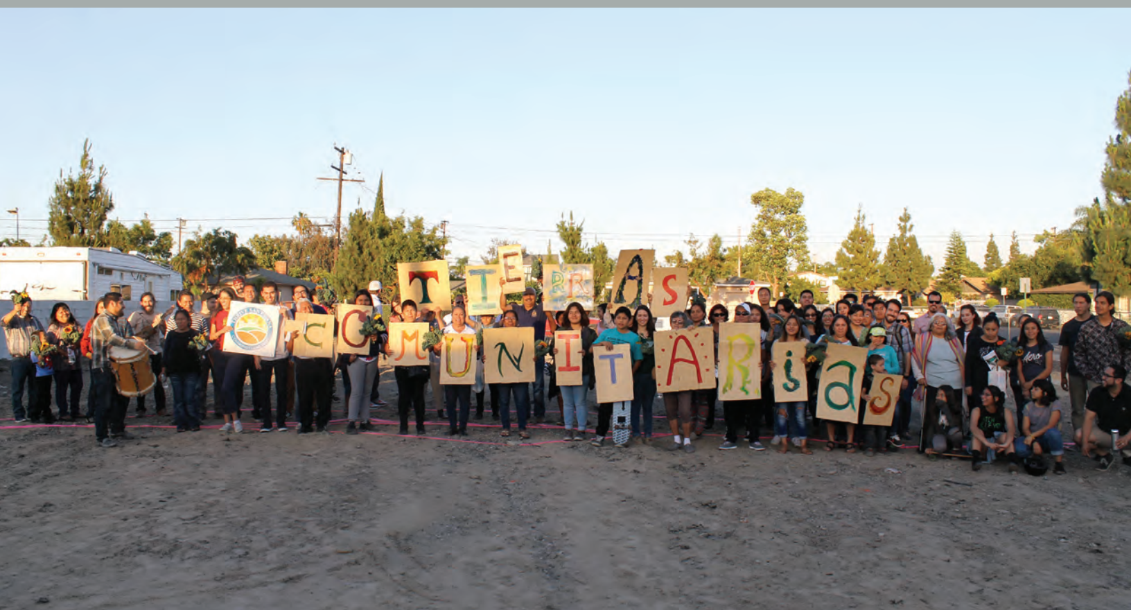
Santa Ana Prospera Event and March to Walnut and Daisy, May 2017, Santa Ana, California