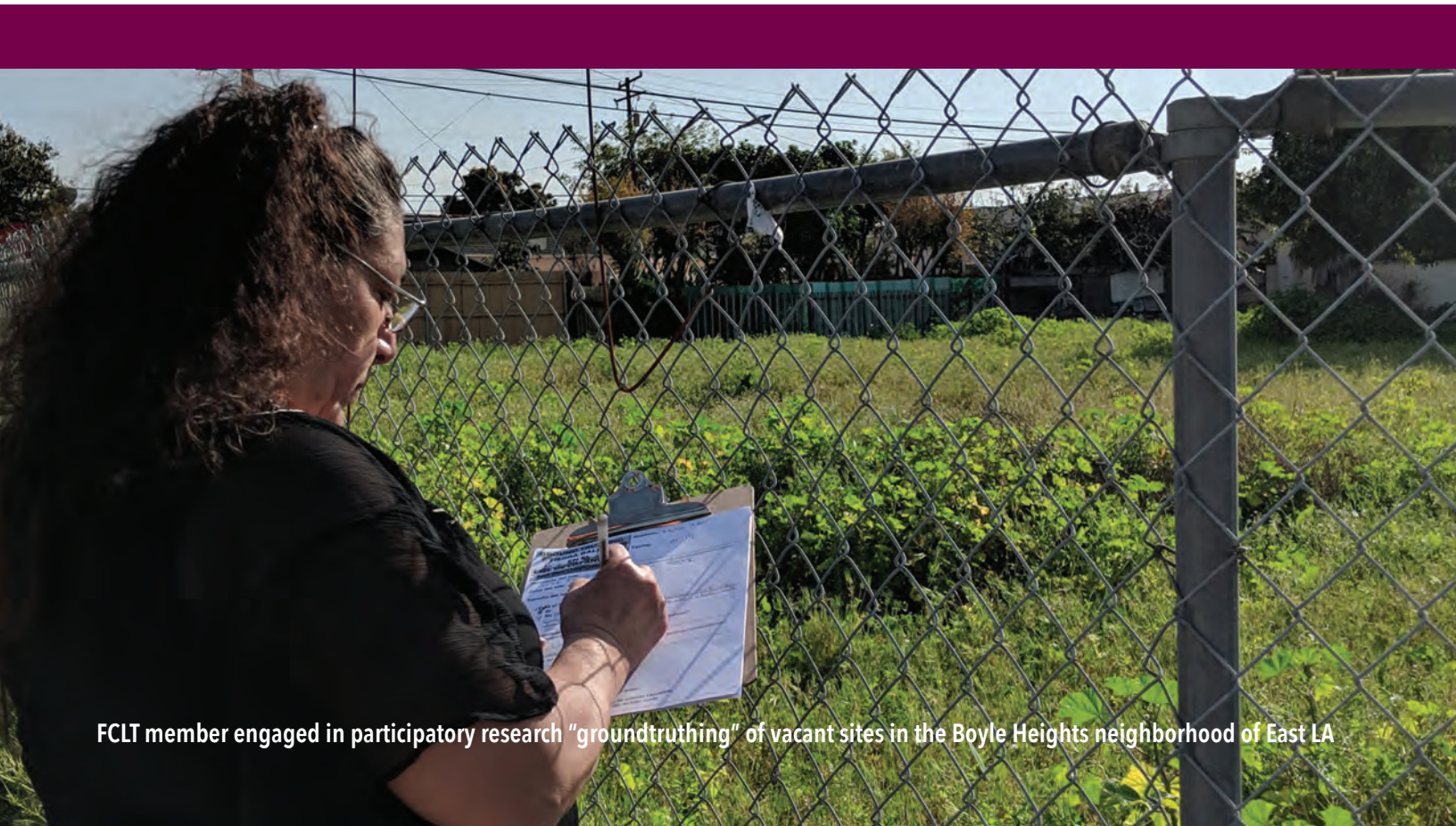
FCLT member engaged in participatory research “groundtruthing” of vacant sites in the Boyle Heights neighborhood of East LA